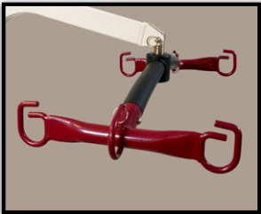
6-point spreader bar maximizes sling options